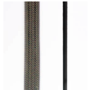
Typical HDMI cable

Bandwidth and data speeds at 16Gbps and beyond support high-resolution images and overcome the limitations of copper cable which can adversely affect HDMI handshake in long distance runs. Celerity Fiber optic HDMI cables may be installed in concealed locations, conduit, plenum spaces and cabling raceways.