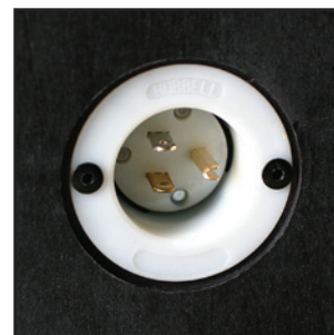
Power input receptacle

See a video demonstration of the setup of the Draper FlatScreen Lift/Case Combo online at: www.draperinc.com/go/FSLCaseCombo.htm