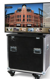
RotoLift™ models fit 37" to 70" flat screen displays