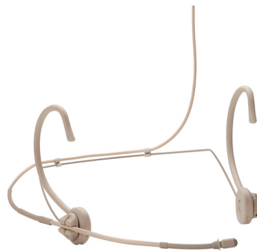
TG H55c tan