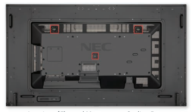
Location of Thermal Management Cooling Fans

Monitoring and managing the temperature of each display is crucial to secure reliability and longevity. An industrial-strength, premium-grade panel with additional thermal protection, internal temperature sensors with self-diagnostics, and fan-based technology allows for 24/7 operation, and protects your display investment. Without thermal management, displays can be prone to damaging heat over time. This damaging heat will lower the picture quality and life expectancy of the product. Integrated cooling fans automatically turn on and stay on when high internal temperatures are detected. These will stay on until the heat is properly dissipated and the display remains under proper temperature thresholds.